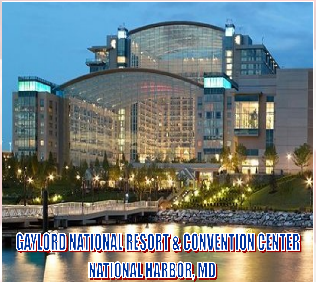
GAYLORD NATIONAL RESORT & CONVENTION CENTER NATIONAL HARBOR, MD